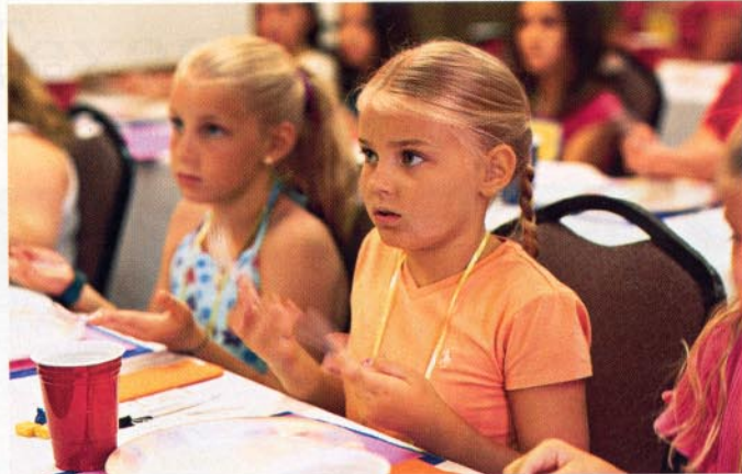
Knife on the right, fork on the left? Courtesy Camp kids practice with paper plates and plastic cups and utensils.

"We've come a long way from fingers to forks," Virginia continues. The word "fork," she tells them, derives from a Latin word, "frutca," meaning pitchfork.